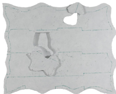
Yan Bo Untitled 1 Mixed Media on linen board 130 x 162 cm 2013

These uncharted traces are the proof of my existence, also the evidence of my soul. I feel the urge of doing this, and I'm happy with it.” — Yan Bo