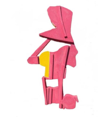
Yan Bo 閔博 Untitled 4 無題 4 Mixed Media on linen board 122 x 244 x 15 cm 2019