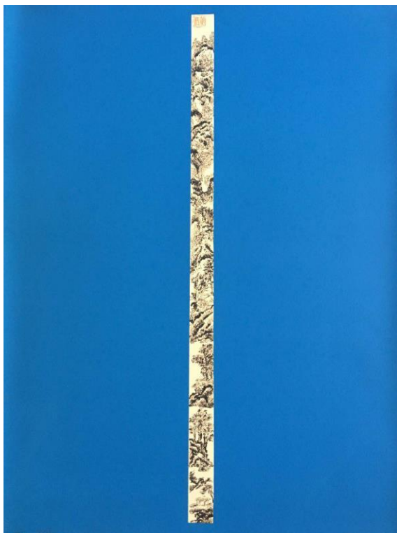
黄岩 一线山水 蓝底 版画 76 x 57cm 2007 Huang Yan, Line.Landscape.Blue, Print, 76 x 57cm, 2007