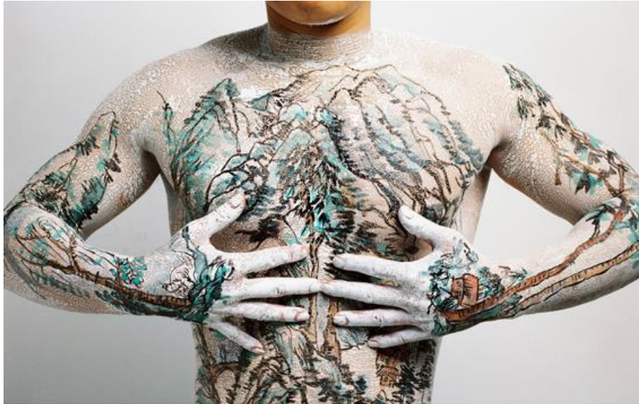
黄岩 中国山水纹身一套 01 摄影 95 x 120cm 1999

This cultural nostalgia carries not only a yearning for the world long past, but also a desire for the spiritual homeland, as well as the future world. A process of continuous pursuit and remodelling is the everlasting spiritual and cultural journey itself, which points to the ultimate destination of mankind.