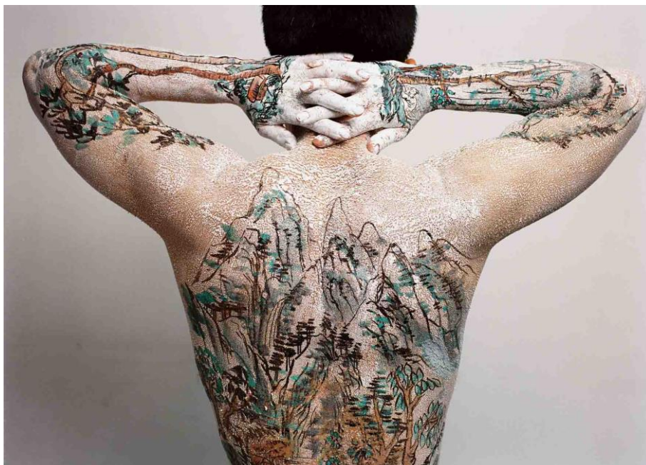
黄岩 中国山水纹身一套 13 摄影 95 x 120cm 1999

Huang Yan, Chinese Shan-shui Tattoo 01, Photography, 95 x 120cm, 1999