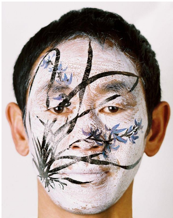
黄岩 纹脸·兰 摄影 150 x 120cm 2004 Huang Yan, Orchid, Photography, 150 x 120cm, 2004