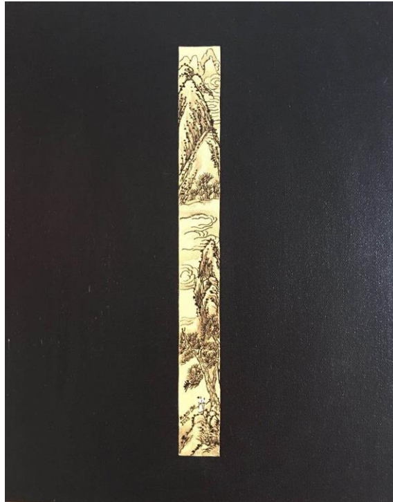
黄岩 一线山水 黑底 No.1 布面丙烯 50 x 40cm 2003 Huang Yan, Line.Landscape.Black No.1, Acrylic on Canvas, 50 x 40cm, 2003