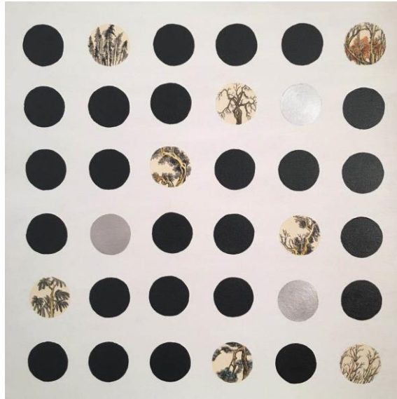
黄岩 点山水 布面丙烯 80 x 80cm 2018 Huang Yan, Dot.Landscape, Acrylic on Canvas, 80 x 80cm, 2018