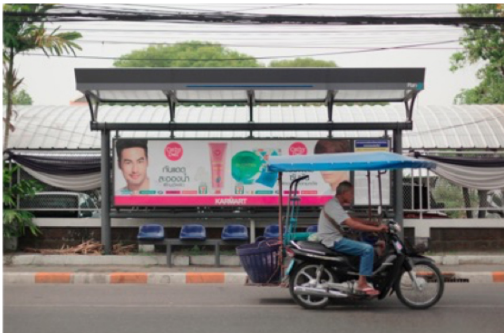
Unintentionally Waiting #2, Photograph, 40x30 cm, 2017

Unintentionally Waiting uses moving images and photographs to show how local governments struggle to facilitate services to the public. Sutthirat Supaparinya is a video and installation artist. By means of her works, she questions the interpretation of images in the media, showing an impact and the relationship of personal and life experiences to a larger structure.