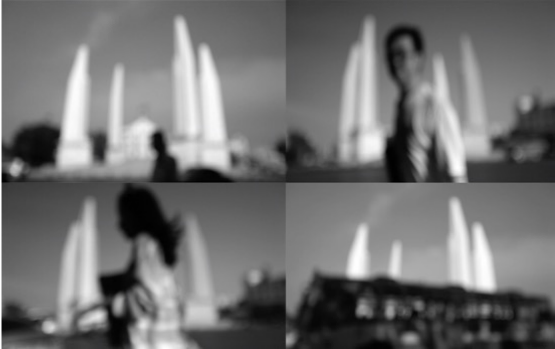
迂回 0 公里 视频 2017 Roundabout at km 0, Video, 2017

“迂回 0 公里”使用了动态图像的形式描绘了人们环行泰国民主纪念碑时的暂停与反转。