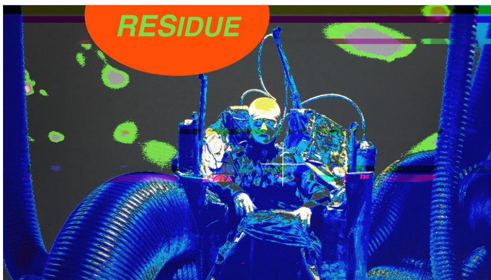
Residue , Photograph, 50x89 cm, 2017