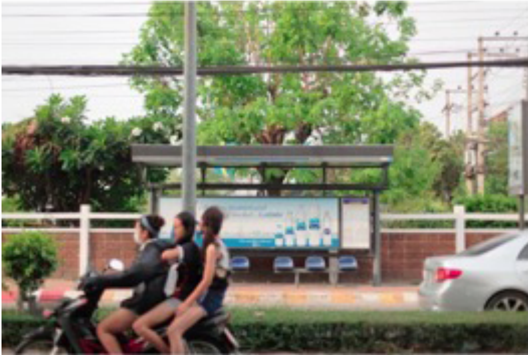
Unintentionally Waiting #6, Photograph, 40x30 cm, 2017