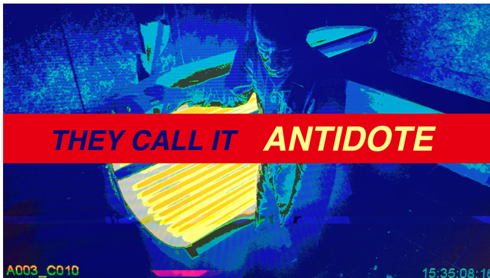
They call it antidote , Photograph, 50x89 cm, 2017

The Sutthirat Supaparinya + Yuan Keru Duo Exhibition is the World premiere of the newest artworks by two artists.