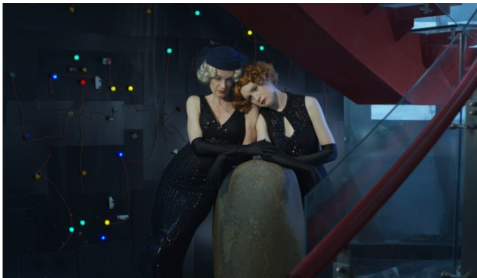
蝴蝶伤城 No.2，摄影，90x160 cm，2017

The Mockingbird under the Lightning, Photograph, 90x160 cm, 2017