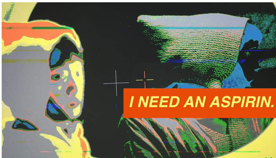
I need an aspirin , Photograph, 50x89 cm, 2017