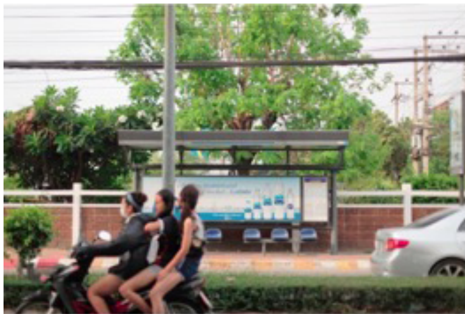
无意地等待 6, 摄影, 40x30 cm, 2017