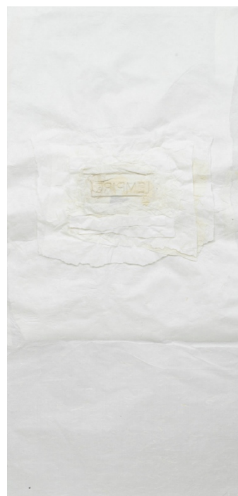
Lin Yan Empire 015 140 x 70 cm Ink, Handmade xuan paper 2018