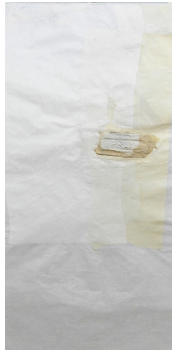
Lin Yan Pray 022 140 x 70 cm Ink, Handmade xuan paper 2018